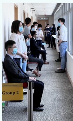
Candidates and observers waiting for the bell